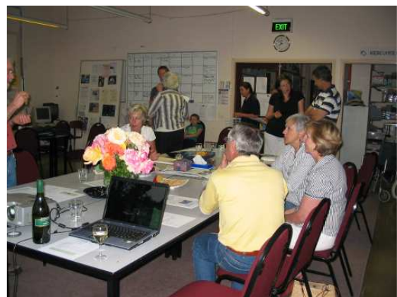
Enjoying a light tea after our AGM

Next Works & Waterwatch: Help get the trees ready for summer Sunday 23 November