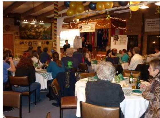
Members and Friends enjoying a well-deserved celebration dinner in August 2010

Members of Friends of Willow Park can feel very proud! We have reached a milestone and have now brought $100,000 in grant funding to our community. These funds are being used to enhance the values of Willow Park and the House Creek corridor, monitor our efforts and educate and involve the community in protecting, preserving and enhancing these areas.