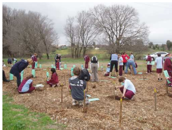
Wodonga Primary School students planting in Belvoir Park on National Schools Tree Day

Friends of Belvoir Park/Sumsion Gardens hosted Wodonga Primary School in planting in Belvoir Park on National Schools Tree Day. The children decorated their own tree guards and had fun planting before a yummy BBQ.